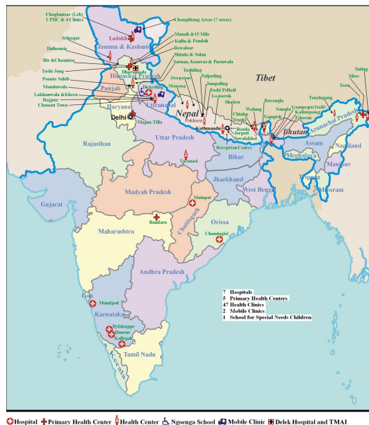
Figure 2: SMS-MobileWeb Information Flow

<name>Nexus007</name> <mobile>44771234578</mobile> <provider>BNL</provider> <entries> <entry date="2008-06-12T09:56:08.593Z"> <lat>35.54</lat> <lon>76.87</lon> </entry> <entry date="2008-06-12T09:56:08.593Z"> <lat>34.10</lat> <lon>77.37</lon> </entry> .... </report> }